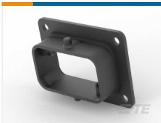
TE Part # 2295892-1 SHROUD PLASTIC