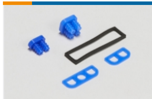
Rectangular Connector Seals(1)