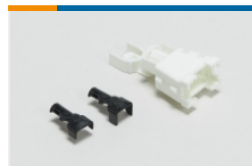
Rectangular Backshells & Clamps(3)