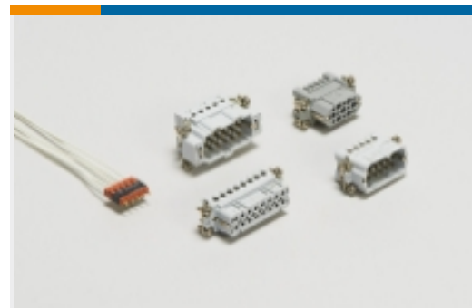
Rectangular Contact Inserts(5)